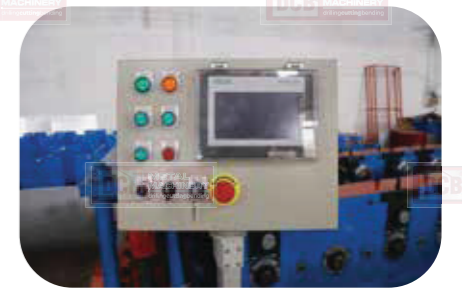
SIEMENS brand PLC Control System