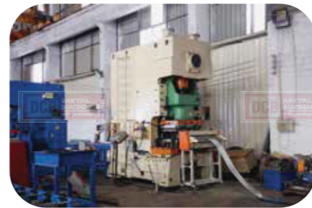
Heavy Duty Yangli Puncher