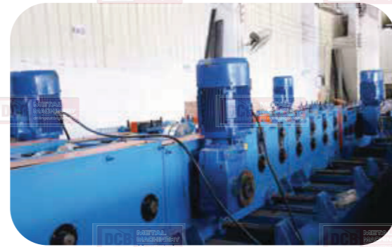
Driving by 4 Main Motors, Size-Changeover is Fast and Stable.