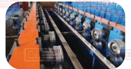
Main Roll Forming Mill (Automatic Size-Changing type)